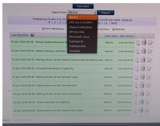
Fig. 2 Import interface in EPrints

Metadata is an indispensable and inevitable for institutional digital repository. Lots of metadata are available in Internet environment but this paper has successfully shows the import metadata from different databases and different software for increasing the discovery services as well as web-enabled services towards present and next level automated and digital library system. It is possible to import the Bib Tex metadata into the EPrints software by using the batch file in Fig.1 and also the process how to import it to EPrints. Obviously, it can save the time of the library professionals and readers also. It can be increases the recall and precision value for the researchers as well as advanced users for easy access of digital resources from this single window based interface.