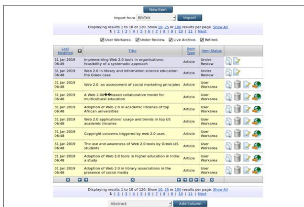
Fig. 3 Items interface in EPrints

After click on the submit button or option it will successfully import the metadata as well as import the item into EPrints just click on the Green button in Fig.3 for import the items one by one respectively.