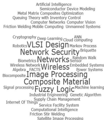
Fig. 2 Tag Cloud created using research areas found in profiles of a Madurai based engineering college

The user profiles of a particular engineering college in Madurai were taken as a sample. The research areas of its 23 researchers were listed. There were about 50 such topics. A tag cloud was created to capture this information in a graphical format in which the prominent areas with higher frequency appear in bigger letters.